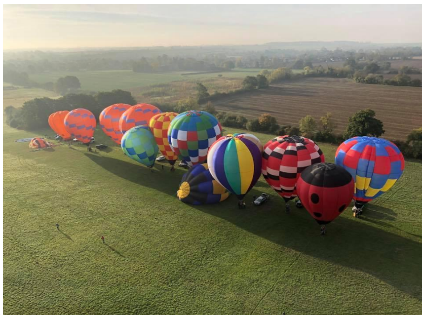
Varied balloons