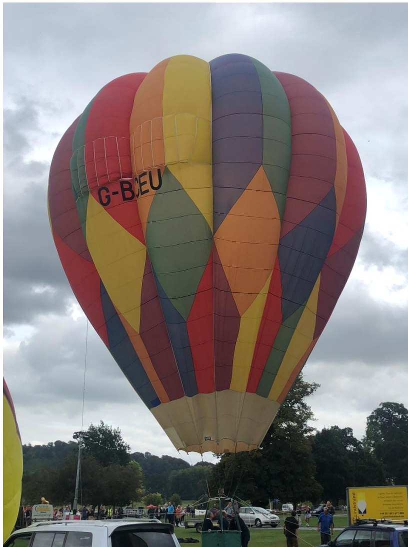
Seen Here tethering at the recent Lingleat Safari festival G-BCEU is a Cameron O-42 of 1974 Vintage.

Your Editor's choice of new and interesting hoppers and duo's active in the world of ballooning right now.