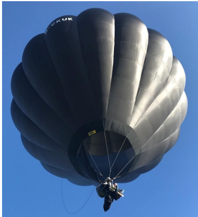
G-CKUK Um Shemilt Eco 50 C/N 50/16

With additional advice from our illustrious editor, who lauded the benefits of a swiveling chair over turning vents, I decided the annex 2 route was the clear winner and as I had once before commissioned an annex 2 hopper, I wasn't fazed by its mysteries. To qualify for Annex 2, an aircraft must be classified as historic, record breaking or prototype.... and as I knew I wanted the balloon to have good duration, Eco-fabrics was a clear winner. An eco-fabric topped balloon cost about £6k more than a standard lightweight 56, and as Ultramagic agreed make me a bespoke balloon with everything lighter, a plan was emerging. They made the balloon without issuing a form 52 (type certification) and I needed (for some reason) a statement from the Spanish CAA that the envelope would not appear on their registry before our CAA would issue a certificate of registration and G-CKUK was born.