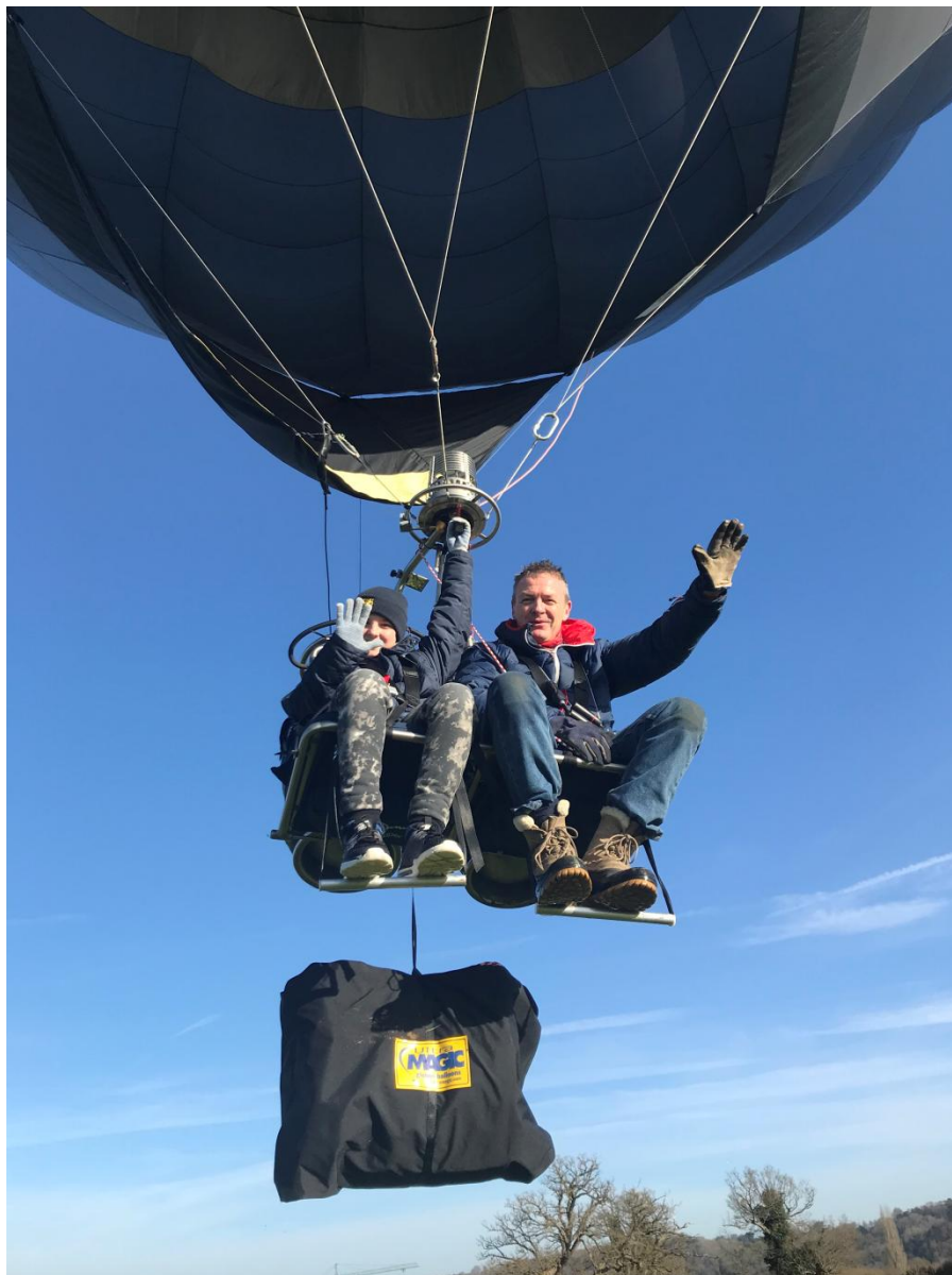
Father and Son at play in G-CKUK.