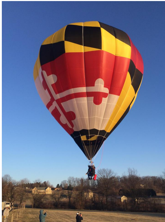
N805LB 36,000 cubic foot hopper