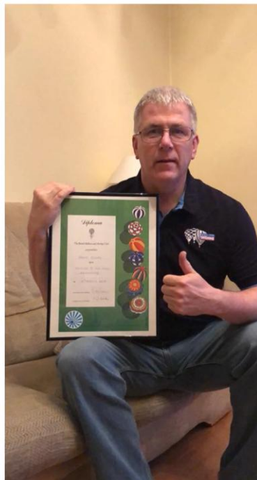
Your Editor with his award.