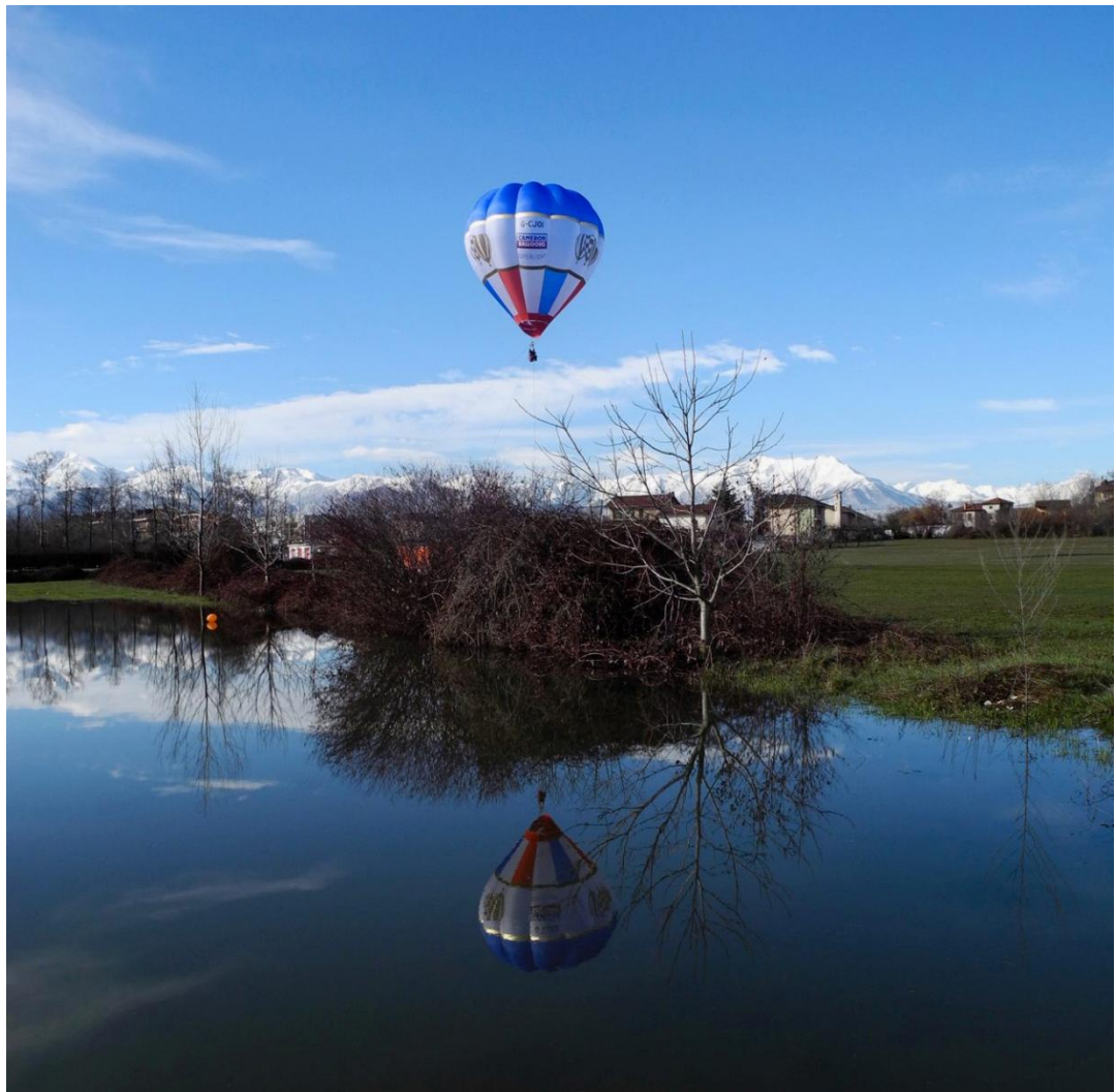
G-CJOI Tethering in Mondovi